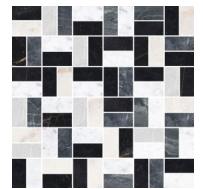
300x300mm Mixed Mosaic