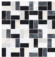
300x300mm Mixed Mosaic